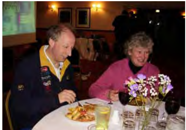
Time to share: tucking into the first Course